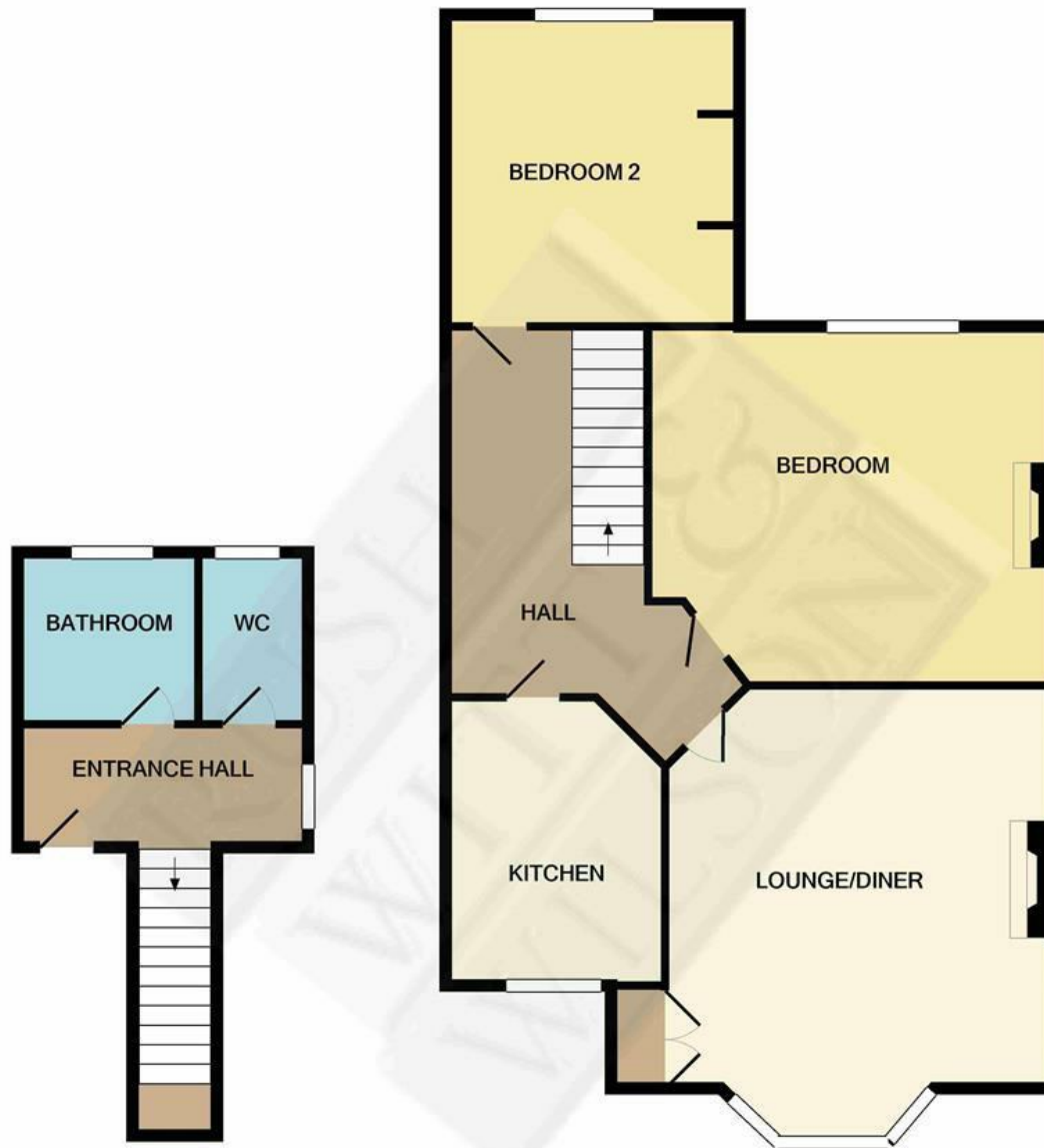
ENTRANCE FLOOR APPROX. FLOOR AREA 166 SQ.FT. (15.5 SQ.M.)